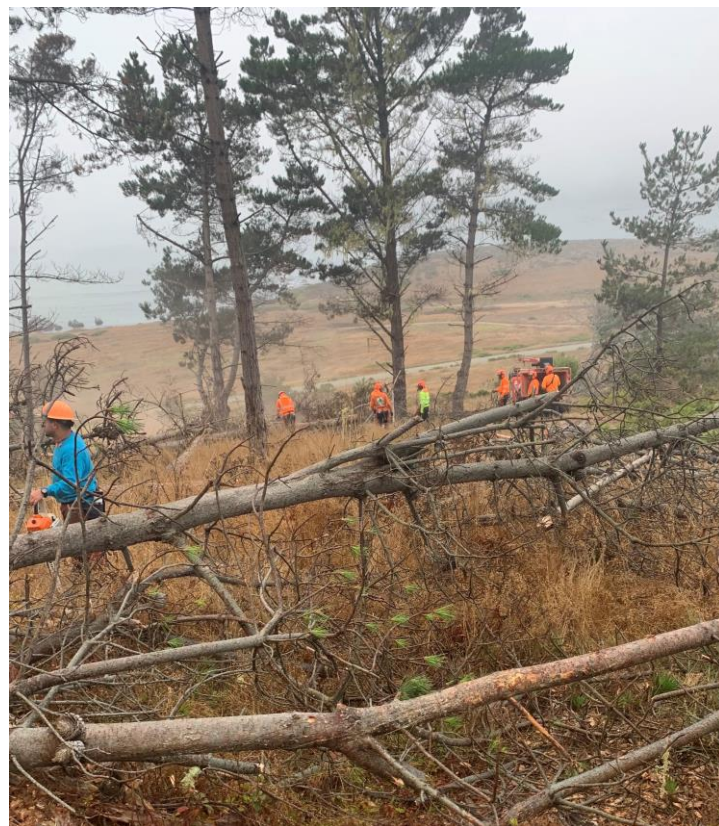
Crew on Monday morning.

By Wednesday afternoon, all major work was complete in the area roughly between the Victoria Way and Marlborough trail entrances and crews were working near the intersection of the Forest Loop and Trenton trails. Temporary trail closures will be necessary to ensure public safety, so please be prepared to take alternate routes. Closure signs will be posted at trail heads. The work should take less than one week.