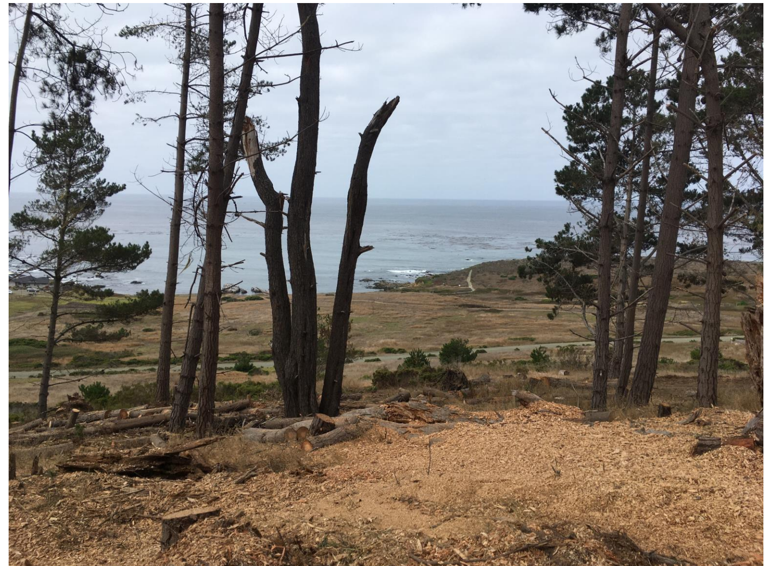
View toward Otter Cover after dead trees chipped.