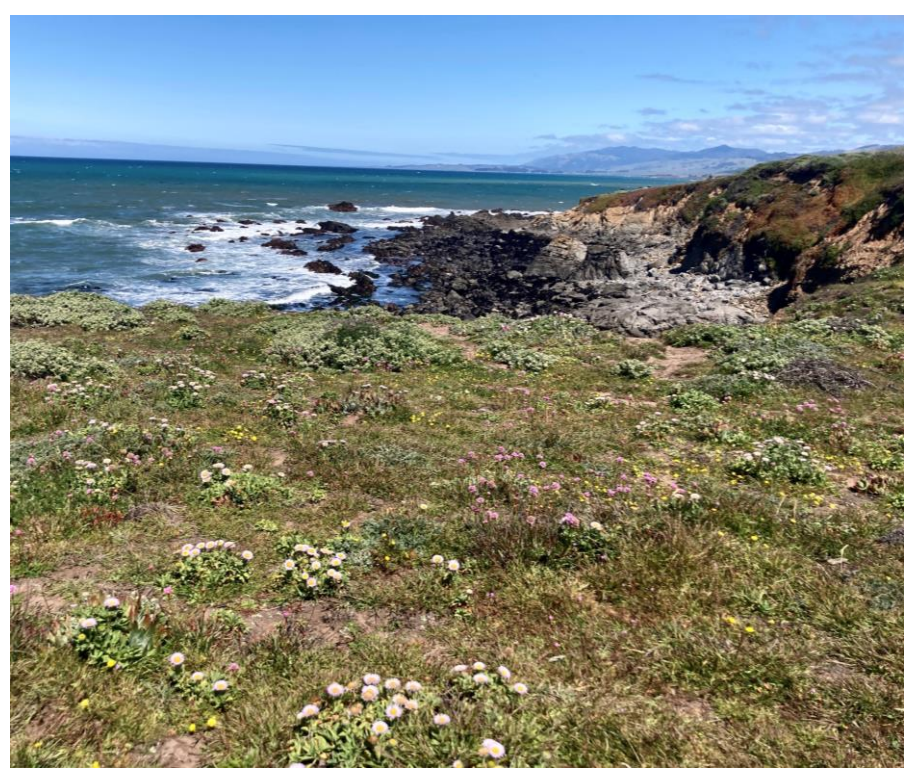
Native plants spread where South African ice plant was removed.

A graduate student at CSU Bakersfield did her thesis research on the Ranch's South African ice plant. She found that ice plant reduced plant species diversity on the bluff and continued to reduce diversity for around 18 months after its removal. After 18 months, though, no legacy effects were detected as native plants returned.