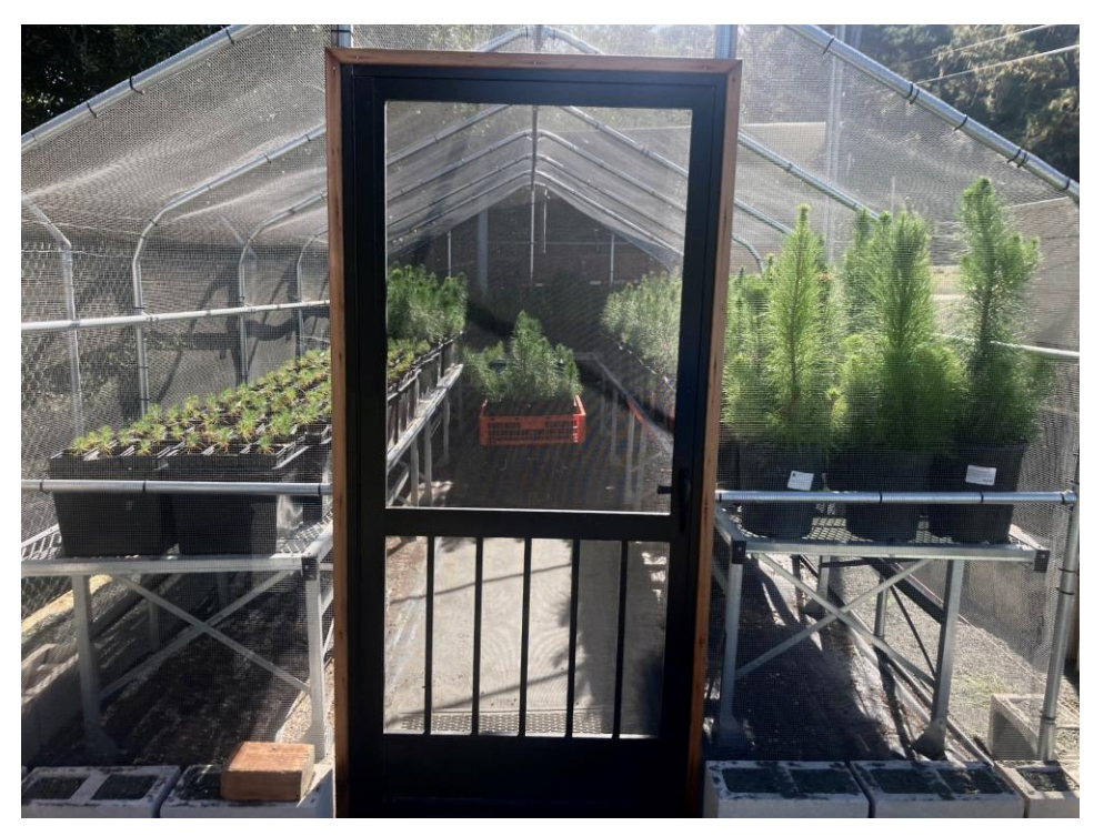
The restoration nursery with two crops of Monterey pine.

Volunteers devoted five days to constructing the nursery, a project that took much effort and ingenuity. Who knew there would be so many pieces?