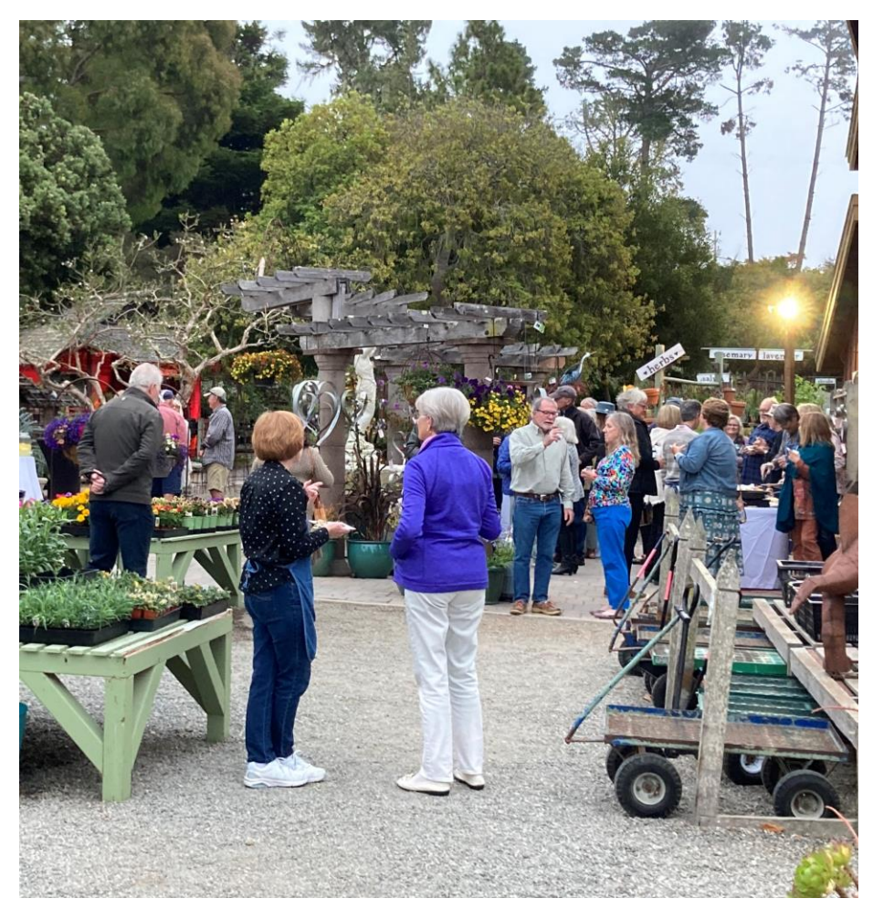
August's Gathering in the Garden fundraiser at Cambria Nursery.