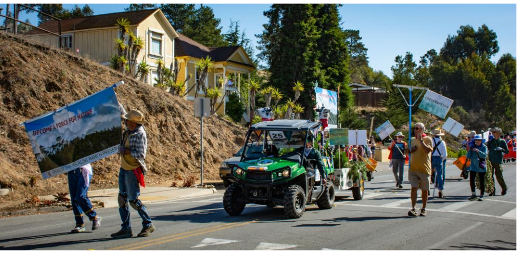
The winning entry heading down Main Street.