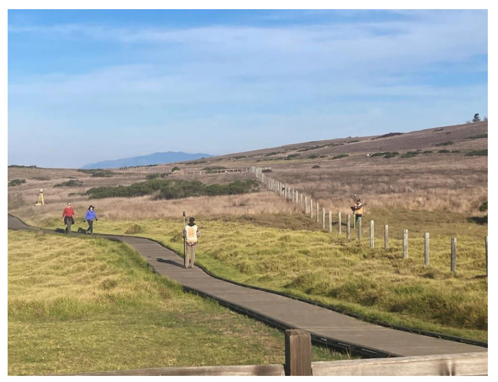
Engineers surveying the new boardwalk alignment.

You can support public access on the Fiscalini Ranch Preserve by dedicating a plaque on the new linking boardwalk in memory of or to honor someone – a favorite relative, beloved friend, or valued neighbor. Make donations online through fiscaliniranchpreserve.org