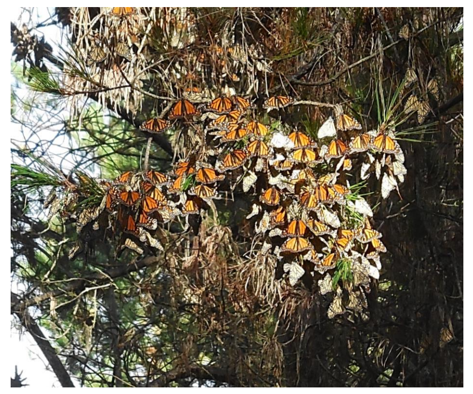
Butterflies clustering near the large monarch grove on the Ranch.

More than 5,000 monarchs overwintered on the Ranch during the Thanksgiving weekend count, bringing their population back up to levels not seen since 2016. This widespread return was welcome news about a beloved species. The Ranch is a rare location where monarchs can still cluster on native Monterey pine trees.