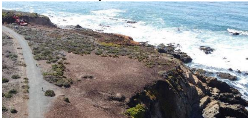
After ice plant removal along the Bluff Trail.