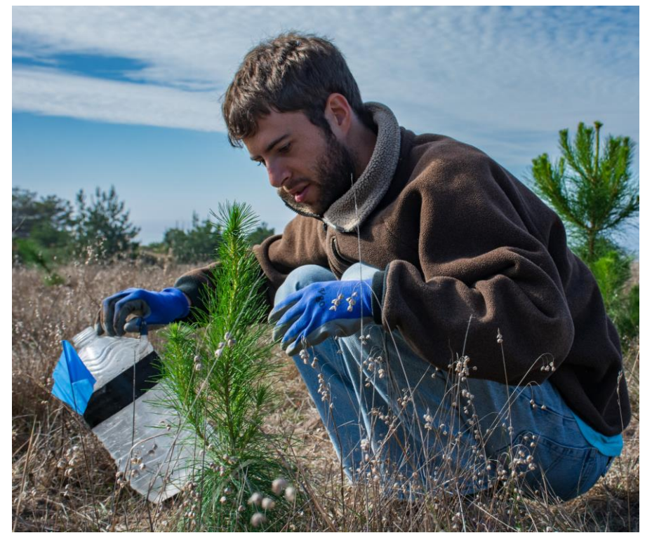
Larger seedlings got a good start during the wet winter.

The annual Thanksgiving Weekend Tree Planting brought out a record number of community members and visitors who planted around 350 seedlings in two hours. Volunteers included Friends of the Fiscalini Ranch Preserve stalwarts and multi-generational groups of first timers.