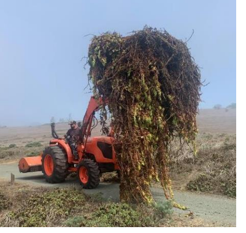
West Coast Tree Service at work.

If left untouched, a monoculture of ice plant would eventually cover untold acres of the Ranch as it has in many areas along California's coast.