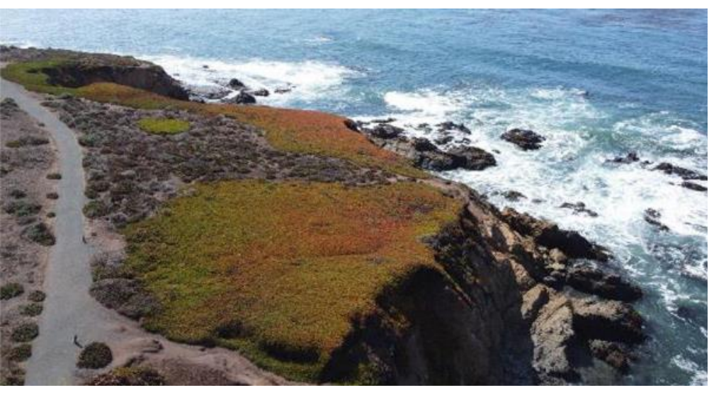
Before ice plant removal along the Bluff Trail.