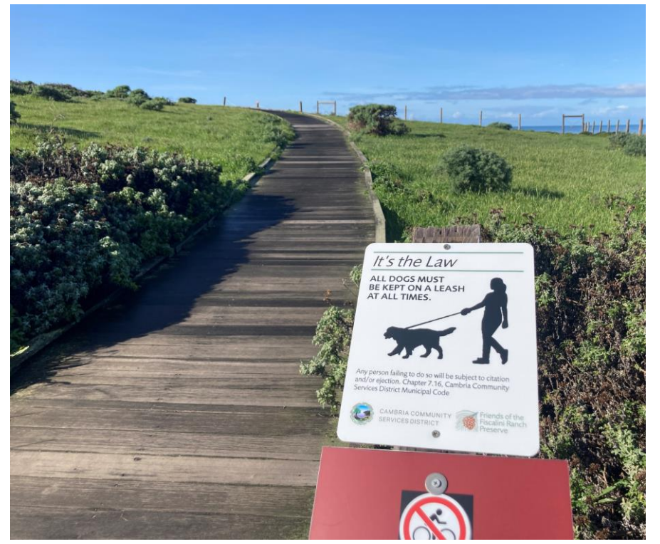
New leash law sign on the Bluff Trail.

To ensure public safety, Friends of the Fiscalini Ranch Preserve requested that Cambria Community Services District (CCSD) strengthen the regulation covering offleash dogs on the preserve. CCSD amended the District's Municipal Code so that all dogs on the Ranch and outside of the dog park must be kept on leashes.