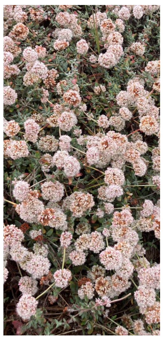
Seacliff buckwheat (Eriogonum parvifolium)